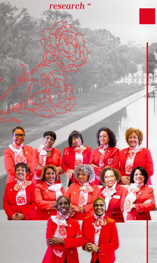
National Executive Board of The Charmettes, Inc.

By forming partnerships with institutions in our communities and nationally, we are furthering our reach into intergenerational programming initiatives, Health and Wellness, and have adopted national initiatives for Anti-Human Trafficking and Mental Health Awareness. This year's convention will feature a Welcome Reception, Founders Prayer Breakfast, Merit Award Luncheon, focused workshops, and The Charmettes' Million Dollar Gold and Champagne Gala . Each event will have speakers on various topics from Cancer Awareness to Leadership. A sponsorship package is attached for your review. We admire your tradition and dedication to supporting organizations such as ours, and we appreciate your consideration.